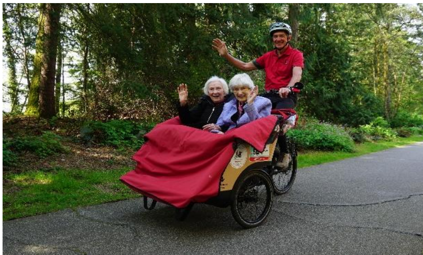
The right to wind in their hair.

We are a program of Silver Harbour Seniors' Activity Centre Society, who's ongoing enthusiastic support makes our mission possible. Our 9-person committee worked hard to advance the program.